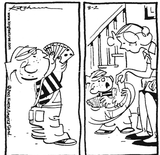
"PICK A CARD, MOM... ANY CARD."